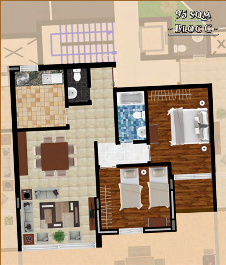
95 SQM - BLOC C -