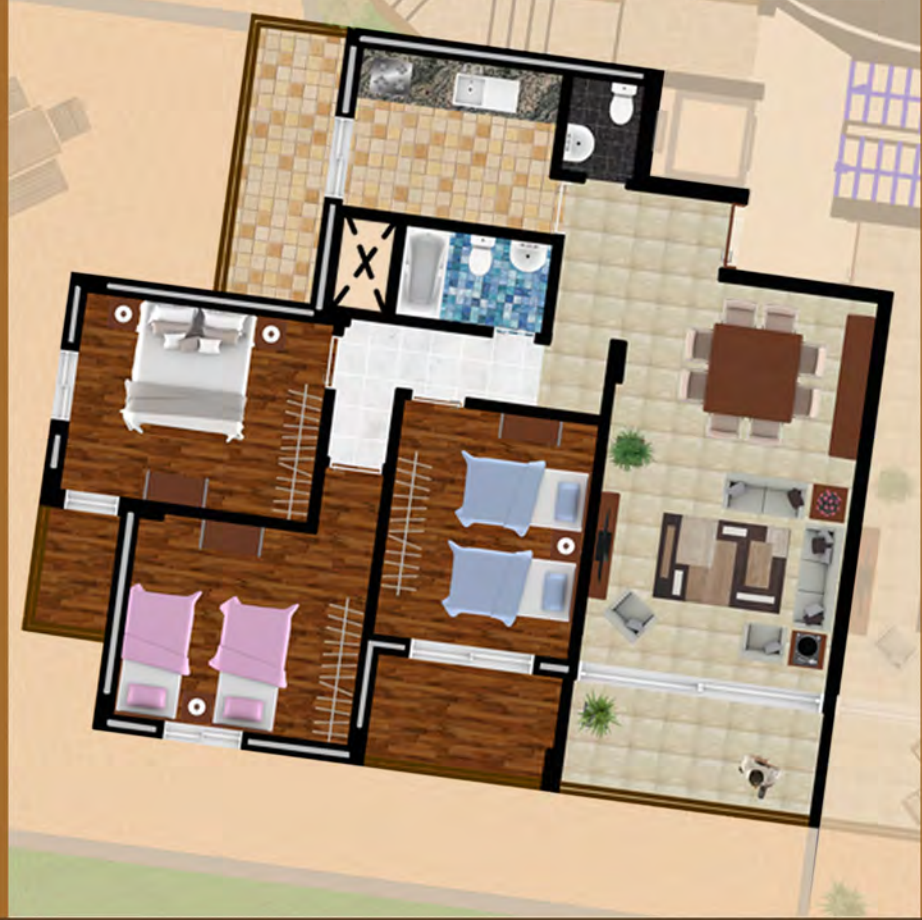
135 SQM - BLOC A -